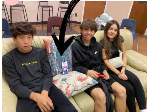
Rocky joined vespers via facetime