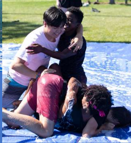
WATER BALLOON DODGEBALL