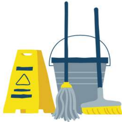
IN & OUTDOOR HOUSE CLEANING