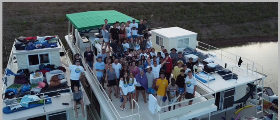
SHASTA BOATING TRIP WAS A GREAT SUCCESS!

More information coming once we start school.