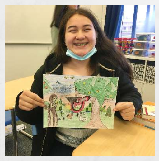
Follow @mrs_cooper_einsteins for more of what is going on is our math classes.