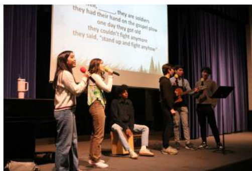
During chapel, a number of students from the junior class take the lead in the song service.