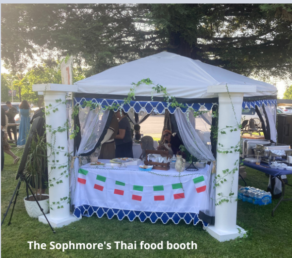
The Sophomore's Thai food booth