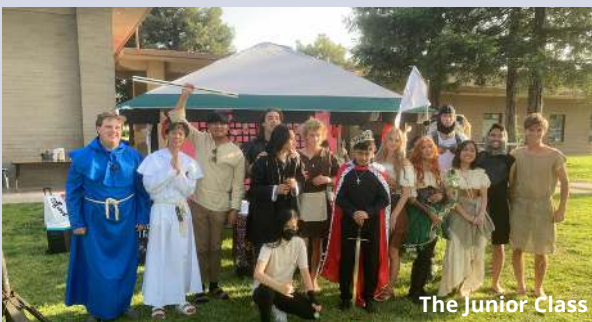
The Junior Class