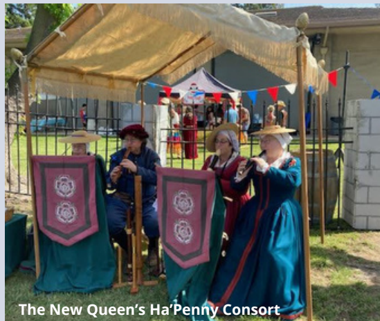
The New Queen's Ha'Penny Consort