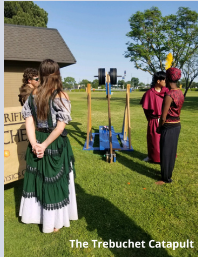
The Trebuchet Catapult