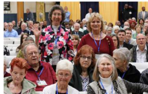
THE CLASS OF 1958 CELEBRATING THEIR 65TH REUNION